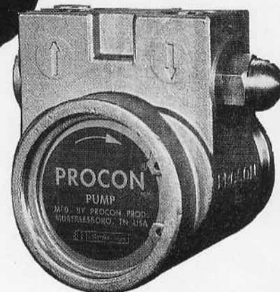
Series 5 Stainless Steel