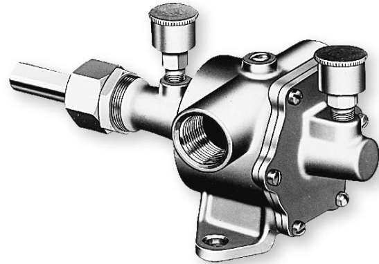
Model 4560-Series, 4590-Series, 4620-Series

Other JABSCO models are also available in bronze, plastic and stainless steel. JABSCO Pureflo® pumps are also available for sanitary applications.