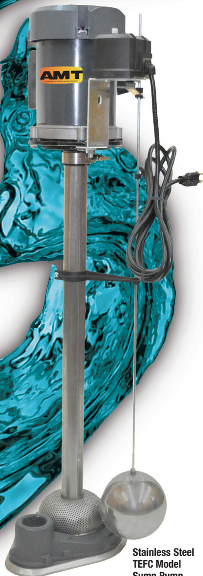
Stainless Steel TEFC Model Sump Pump